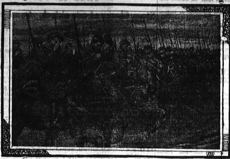
COSSACKS PRAYING IN THE BATTLE LINES