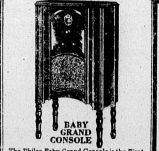
Philco Baby Grand Console is the first full fledged, full toned, big performing screen grid radio ever produced in a handsome cabinet at this price. Chassis as in Baby Grand, cabinet is genuine walnut and bird's eye maple trimmed with African extra wood. Price $ 97.50 less tubes.

These sets are the first REAL radios ever produced in such compact cabinets and at such prices. Their amazing sensitivity and selectivity are a never failing source of surprise to their thousands and thousands of owners. Of course being a Philco they expected the Baby Grand to be good, but they never dreamed it possible that even a Philco at this price could outperform many sets costing two or three times the money.