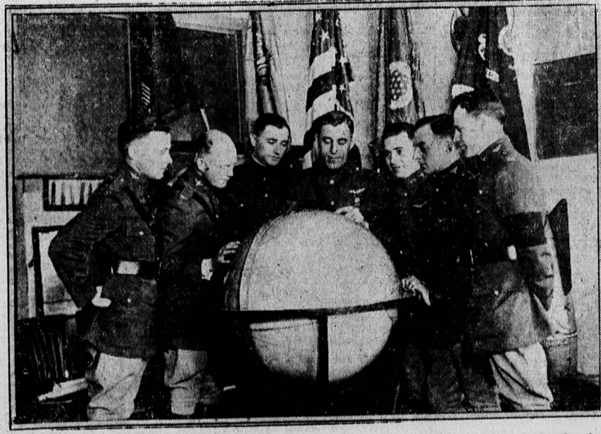
The U. S. Army's "around the world" fliers, met at the Headquarters of the U. S. Air Service, recently to receive final instructions.

(British United Press) SAN JOSE, Costarica, Mar. 4.—A series of earth shocks, the strongest felt here in twenty five years beginning at four o'clock this morning, damaged fully half the buildings of San Jose and caused a number of casualties.