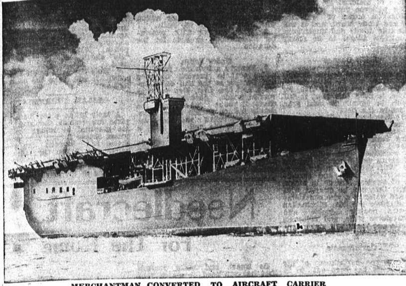
U.S. Charger, formerly a merchant ship, is shown after conversion to an aircraft carrier. (Official U.S. Navy photo from NEA).