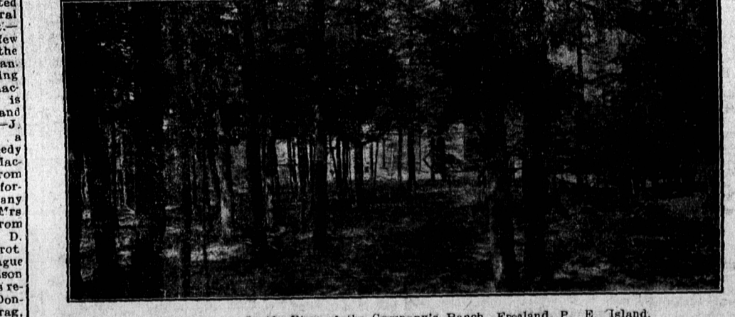
Inside View of the Company's Ranch, Freeland, P. E. Island.

receiving $9,000 in cold, hard cash, if the Company so desire, of his in the stock of this company. In fact for one of his female foxes, is one of the best silver foxes and each pair today could hardly be sold at $20,000 not to mention, the ranch and its equipment furnished at a considerable cost, which is provided by the promoters free of charge to the investors. The directors of the 'Freeland Silver Fox Company Limited' are determined that there shall be no water in their stock, that every shareholder will get one hundred cents on the dollar for every dollar invested