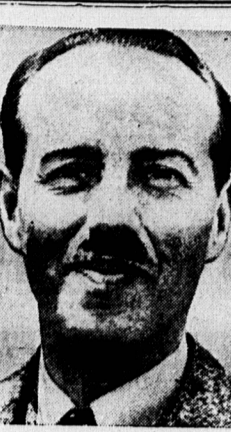
EX-PREMIER TO ENLIST

Dr. Paul Van Zeeland, former premier of Belgium, said May 11 he would return to his country by Clipper plane to enlist. He has been in New York as chairman of the Co-ordinating Foundation of the Inter-governmental Committee for Refugees.