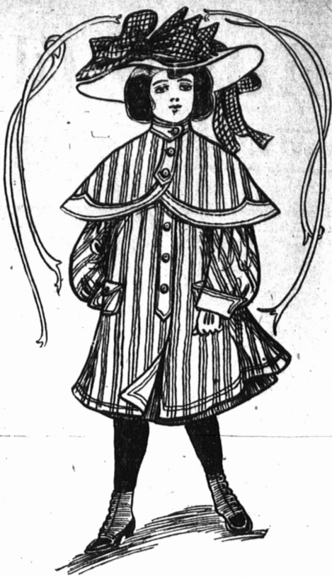
A chic light-weight flannel cloak for little girl. It is white, striped with black. The trimming consists of bands of white broadcloth, stitched with black. White pearl buttons are used. The white felt hat is trimmed with black and white plaid ribbon.

There is no Salt for table use that can compare with WINDSOR SALT. It is absolutely pure, never cakes, and is always the same perfect quality.