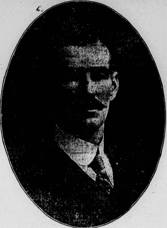
HON. JOHN A. MACDONALD, CONSERVATIVE CANDIDATE FOR KINGS

—“BUHACH” and Izal Flour Powder sold at Brace’s. 5557-7-23-21. —IZAL DISINFECTANT in stock at Brace’s. 5557-7-23-21. —“BEAYCO” English Fox Netting, the netting that goes up without bagging or sagging, all sizes in stock at Brace’s. 5537-7-22-21. —REPLACE THAT OLD TIRE and avoid accidents, all sizes in stock at Brace’s. 5537-7-22-21. —MAXWELL ELECTRIC WASHER, the latest and best, $89.00 at Brace’s. 5552-7-23-21.