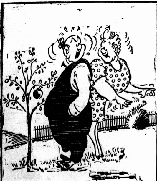
"I don't care what the nursery said in their Guardian Want Ad—you can't grow peaches this time of the year!"