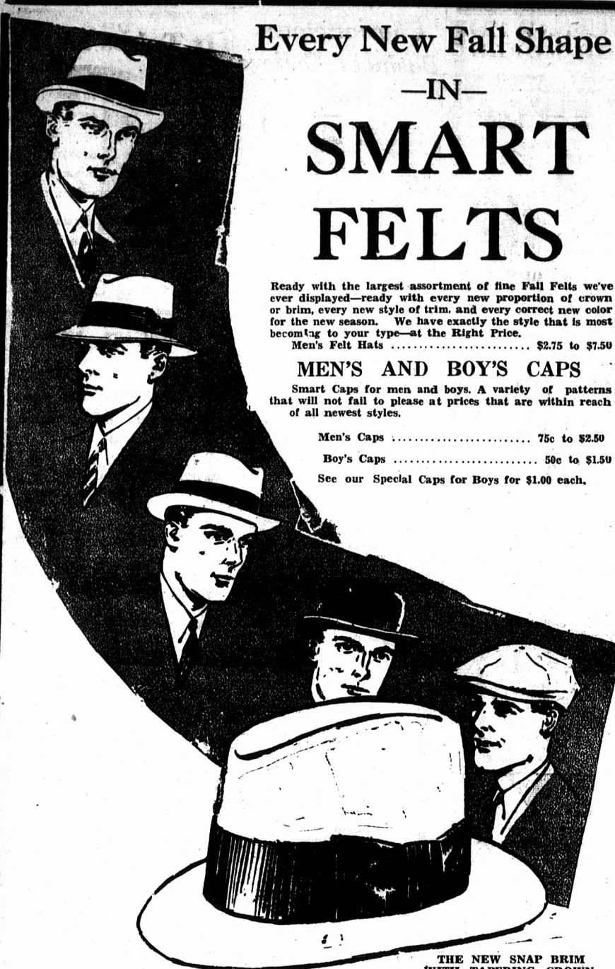
THE NEW SNAP BRIM WITH TAPERING CROWN

See our Special Caps for Boys for $1.00 each.