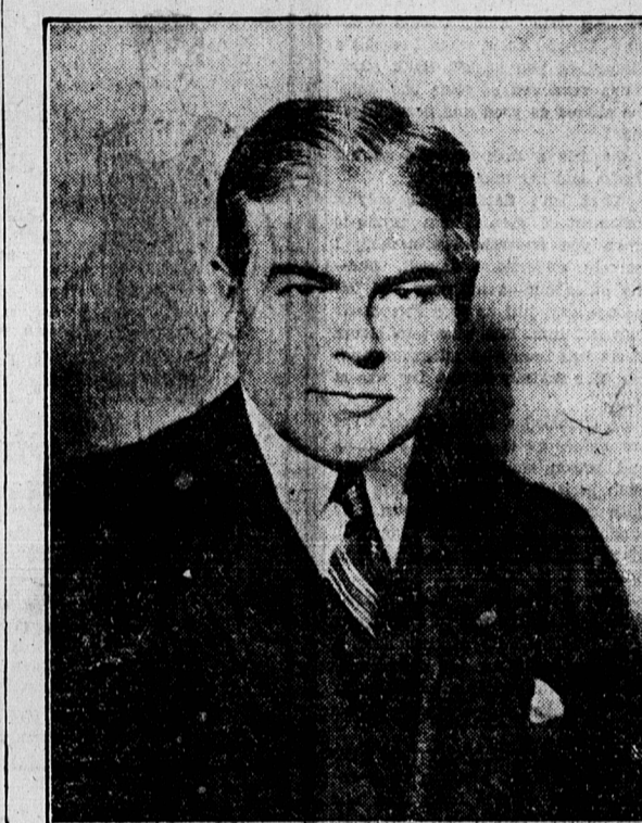
E. W. Beatty, Chairman and President, Canadian Pacific Railway who is visiting this Province while on his annual tour of inspection through the Maritimes.